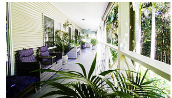
Modern Home with S/C Flat and Lake Views!